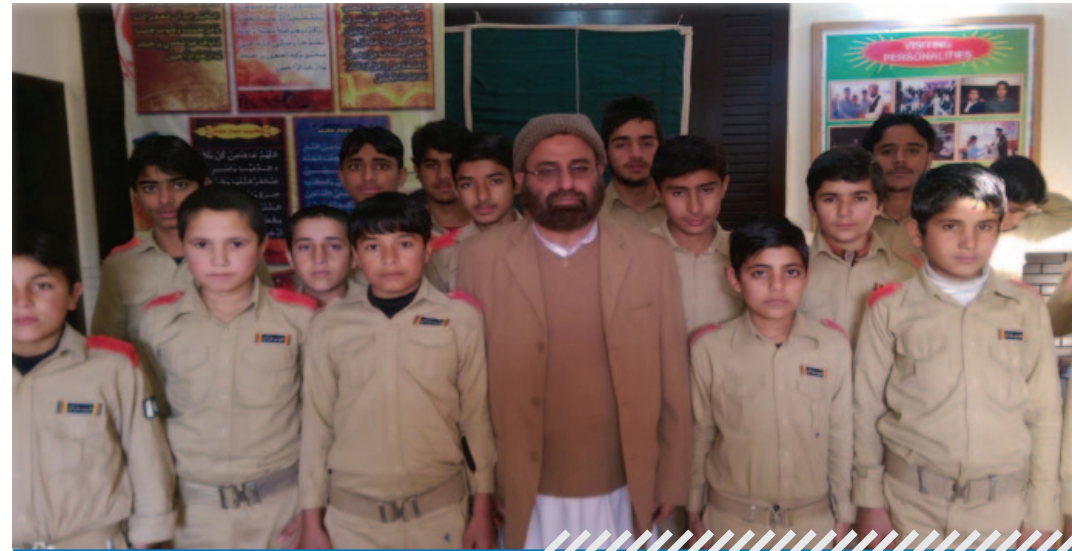
Orphans of martyrs receive free education in Al-Mustafa School, Islamabad

At Share, we aim to lift the despondent group of societies. Often, they are those who are overlooked by others and are desperate for financial and administrative support.