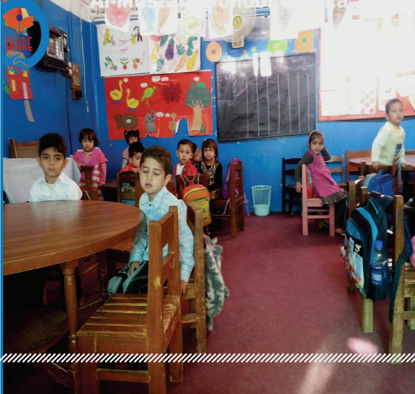
Pre school Students Al-Mustafa School, Quetta